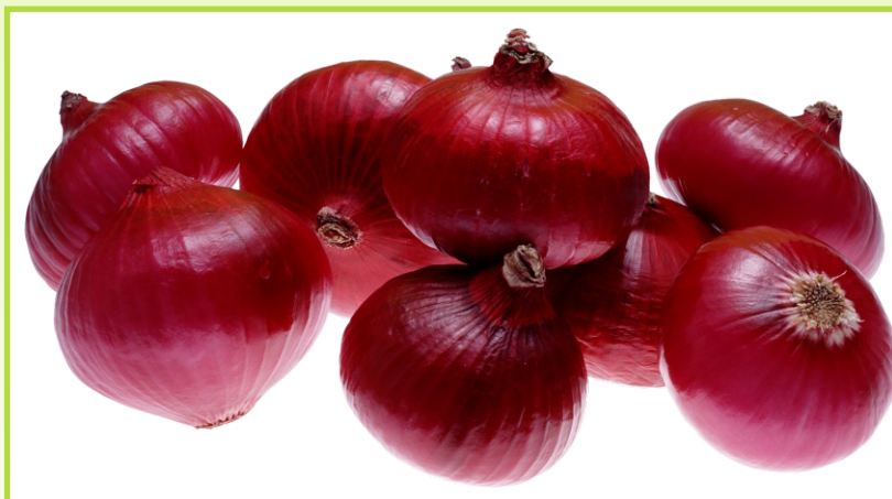
Red Onion (Winter Crop)