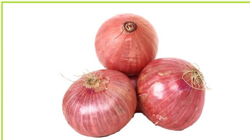
Garwa Onion (Summer Crop)